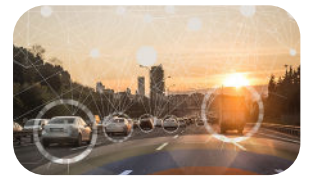
Precision Analog / Sensors