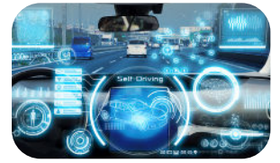
Automotive / Power