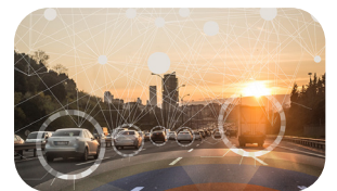
IoT/IoV & Optoelectronics