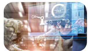
Industrial & Medical