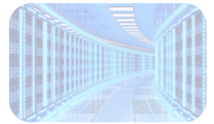
Computing & Network