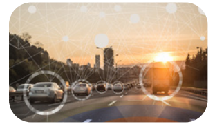
IoT/loV & Optoelectronics