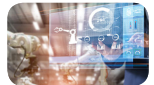
Industrial & Medical