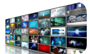
Flat Panel Display