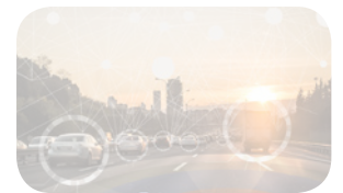
IoT/loV & Optoelectronics