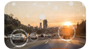
IoT/loV & Optoelectronics