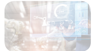
Industrial & Medical