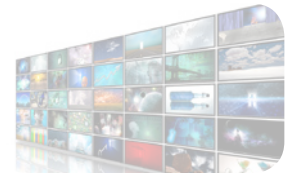
Flat Panel Display