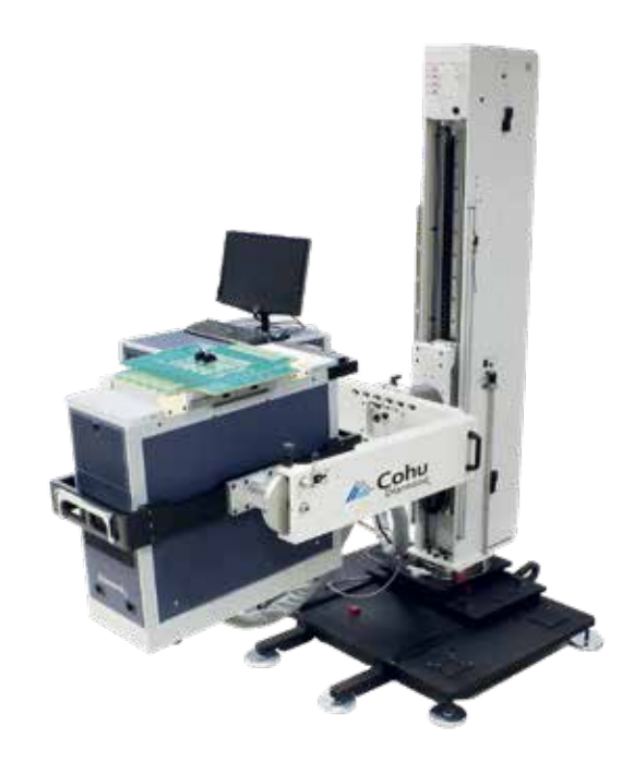
The High Power Voltage/Current Source ( HPVI_x ) is a high voltage programmable power supply for the Diamondx test system targeted for use in power management, automotive, and display driver applications.