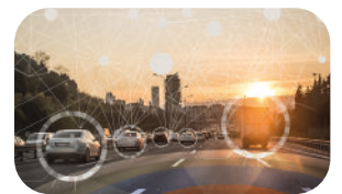
IoT/IoV & Optoelectronics