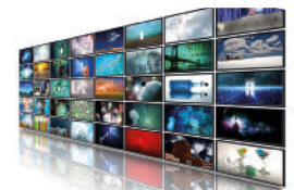
Flat Panel Display