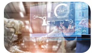
Industrial & Medical