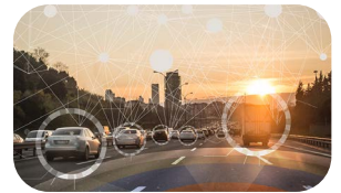
IoT/IoV & Optoelectronics