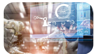
Industrial & Medical