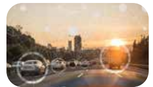
IoT/IoV & Optoelectronics