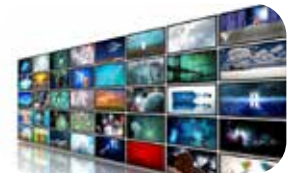
Flat Panel Display