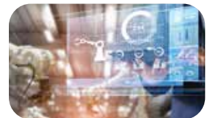
Industrial & Medical